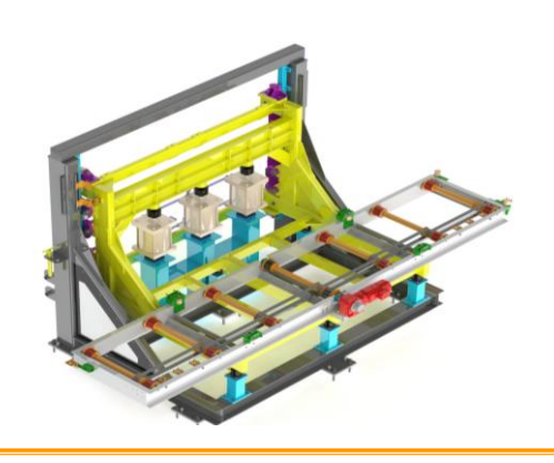
Design Feed Dog Module